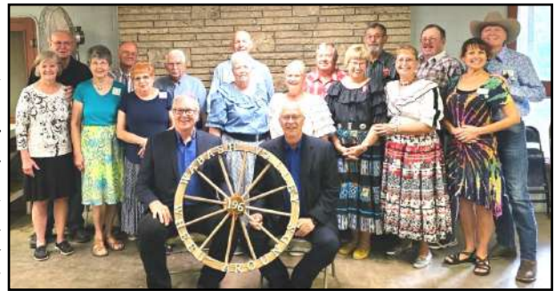
Good times in Nauvoo, IL

('Chats' continued from page 23) toric Site. We did, however, manage to find a Mexican restaurant to eat at for one of our evening meals. Another highlight was visiting a local museum on a steamship with a very knowledgeable curator/ guide. The wonderful