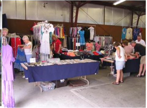
We had convenient shopping.