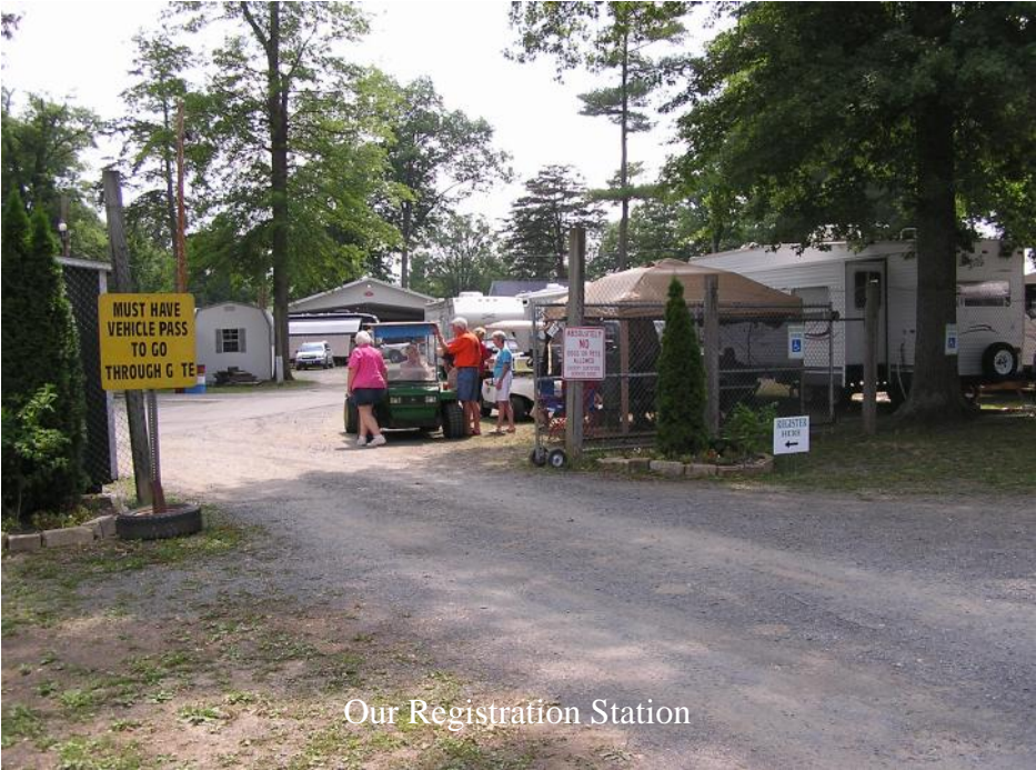
Our Registration Station