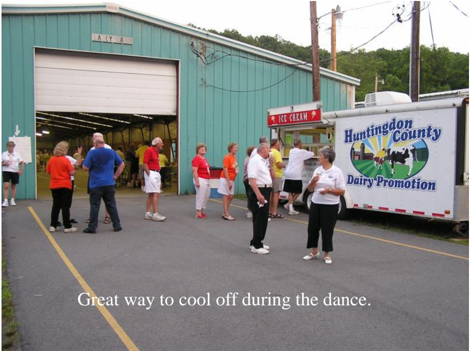
Great way to cool off during the dance.