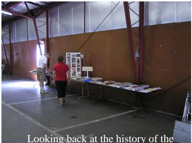
Looking back at the history of the NSDCA