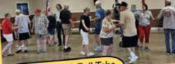
Teddy Bears & Pull Tabs