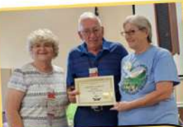
Chapt 058 "50" Anniversary