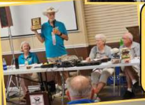
Meat & P D I N N E R S