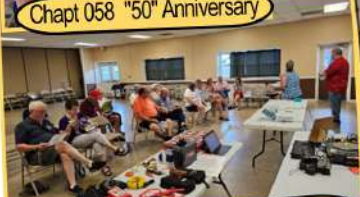
RV Education - Workshops - Dancing